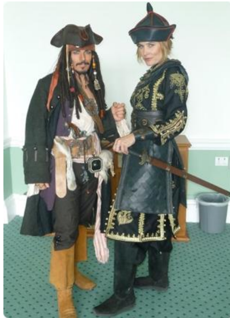
PIRATES OF THE CARIBBEAN