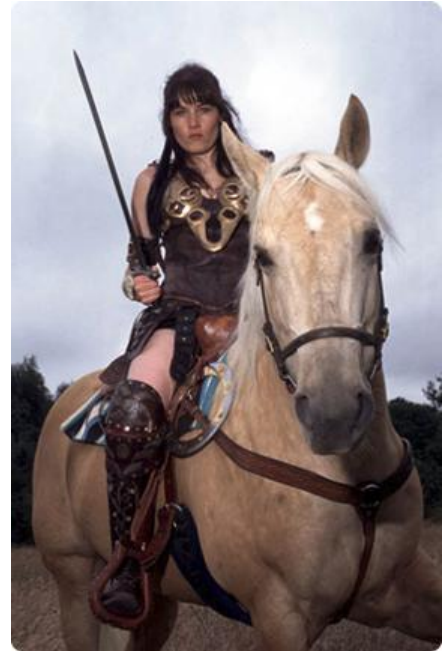
XENA WARRIOR PRINCESS

Ever had the feeling your event would benefit from a major injection of glamour from Hollywood, only to find that your budget gets you no further than Cricklewood?